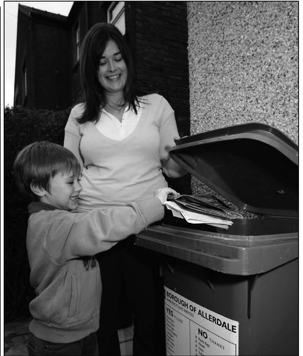
Far from rubbish: residents have helped Allerdale Borough Council to recycle half the borough's waste

More information about the 2011 Census can be found at www.census.gov.uk