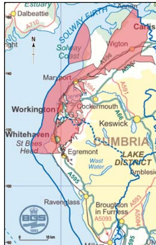
A map highlighting the areas in pink that have been deemed unsuitable for a future nuclear waste disposal facility. Ordnance Survey mapping, Crown copyright.

Councillor Davidson added: "We want as many people as possible to get involved in helping to make the decisions about this important issue. There is still time to get involved and your views are very much welcomed."