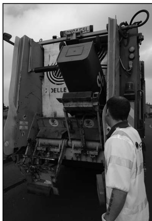
Environmentally efficient: recycling collections

Recycling and refuse collections across Allerdale are being made extra efficient in a bid to allow even more homes to benefit from the successful purple bag recycling scheme.