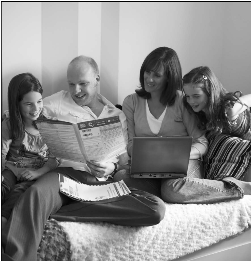
Sign up to the census: It could help to benefit your community

For more information on recycling, contact Allerdale Borough Council's recycling team on 01900 702800, email street.scene@allerdale.gov.uk or visit www.allerdale.gov.uk/recycling