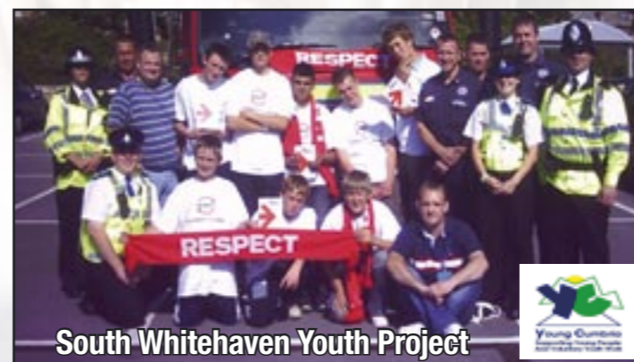
South Whitehaven Youth Project

the South Whitehaven Youth Project, Young Cumbria on the production of this leaflet which will perform a valuable service in raising the awareness in young people of the impact and consequences of anti social behaviour and help to improve the safety and quality of life for all members of the community.