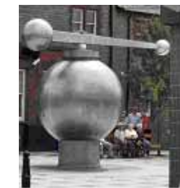
'Lookout': The new town clock

The second completed work was the 'Lookout' clock. Lookout is an interactive, mechanical clock designed by artist Andy Plant. The clock is situated on Ivison Lane, just off Pow Street, next to the NatWest bank. The clock's minute hand has a camera at the end and rises into the air on the hour to give people a panoramic view of the town via viewing windows on the spherical body of the clock.