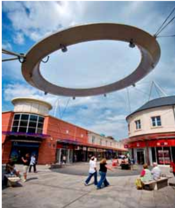
'The Hub' 3D Soundscape

The Hub's 3D sound system can be configured to broadcast any live or recorded sound, Allerdale Borough Council are working in partnership with SoundWave as well as local performers and community organisations to programme and create new work to be performed in the space in the future.