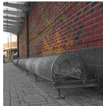
Fyke Net Seats

Fyke Net seats - These seats refer to the design of Fyke nets or hoop nets used to catch eels and other fish in coastal waters and rivers. Fyke nets have the advantage of not harming fish and modern nets prevent otters from becoming trapped.