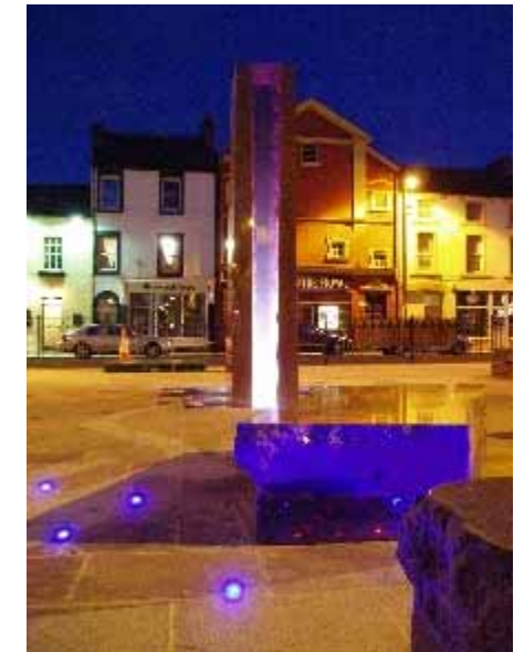
'Coastline': A new town square for Workington

Coast Line consists of twelve large sculptural seats carved and sawn from boulders of red granite quarried at Shap, with some seats featuring cast clear resin bases underneath.