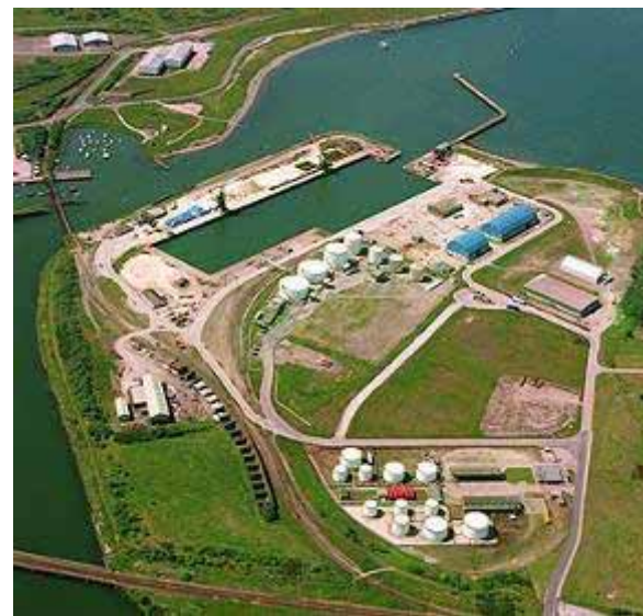
The Port of Workington from the air

Further information can be found at The Port of Workington website: www.portofworkington.co.uk