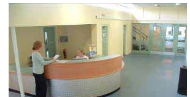
The refurbished Workington Leisure Centre reception

A new seating and vending area was created and high quality customer information notice boards installed.