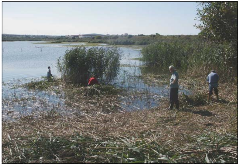
Volunteers in action at Siddick Ponds.

LNR's are important because they place an emphasis on community involvement and environmental education, not to mention the normal conservation type activities you would expect at nature reserves. LNR's are located close to where people live, giving people easy access to nature and opportunities for quiet recreation.